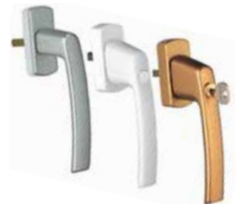
Harmony window handle