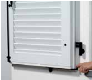
Deluxe shutter catch

Many people find shutters charming. But they are more than just a decorative element. They provide protection against rain, hail, sun, snow and coldness, stop gazing eyes and make a burglar's life more difficult.