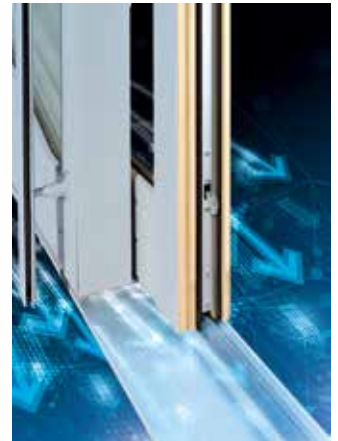
Steel hook drive gear