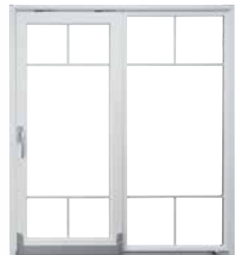
SKB-Z system with forced control