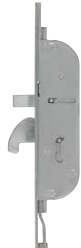
Hook&bolt locking system