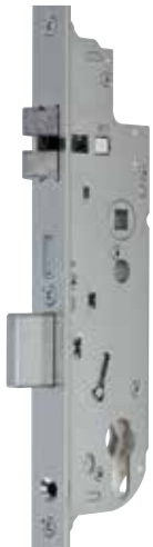
Z-TA automatic lock

PROTECT door locks are perfect for any front door, apartment door and side entrance door as entry point to public and private areas. After all, the innovative multi-point locking system helps to provide effective protection against damage and theft for protect property and the private sphere. Additional packages, such as noise protection and thermal insulation are taken into account just as much as the desire for the convenience of keyless door operation.