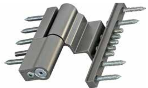
Partially concealed T100 R butt hinge