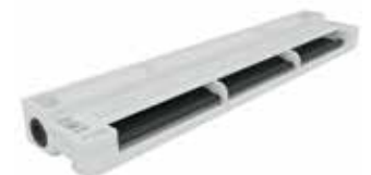
Concealed window valve