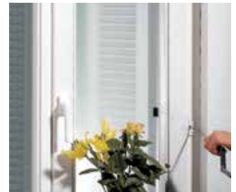
Shutter inside openers